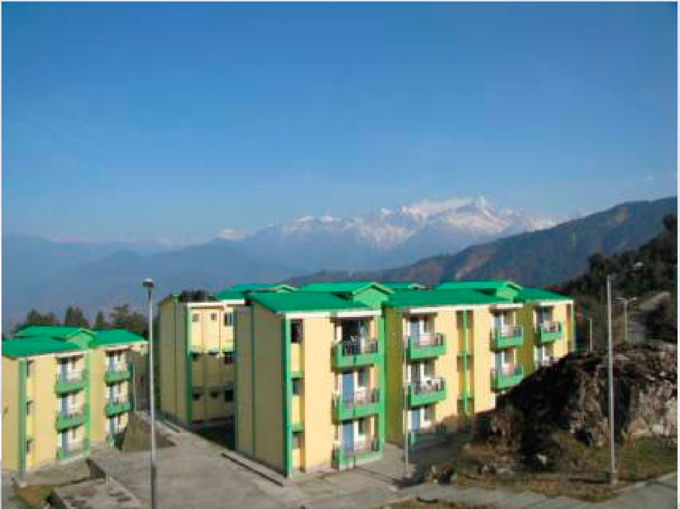
Campus - NIT Sikkim