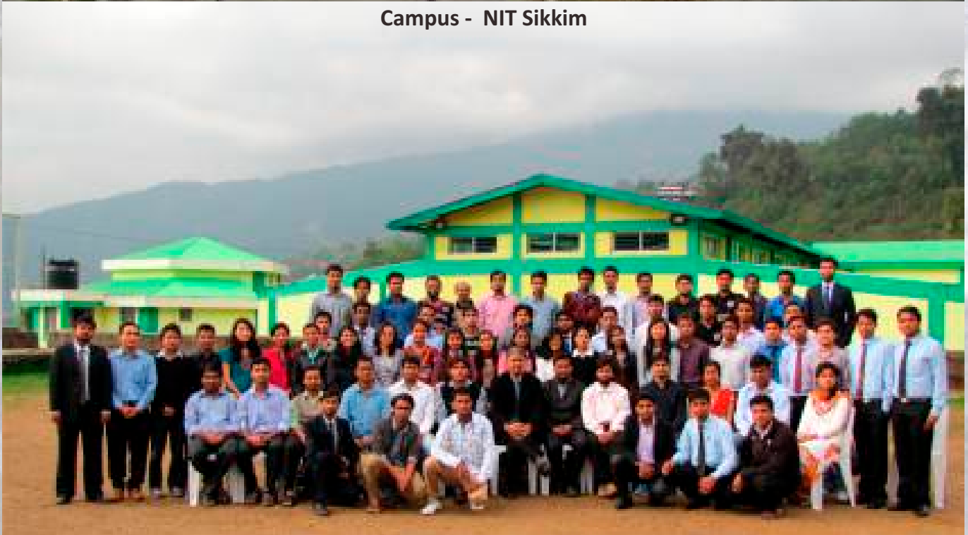
1st Batch of NIT Sikkim